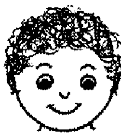
04=Agree XNŪ ē %ōŌŌĪ#∞