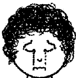
01=Strongly disagree Jā`Ā∞ XN`Ū ē HA#∞

Fieldworker: Show Chart #3 with 5 faces, starting from "Strongly disagree" to "Strongly agree" and explain the meaning of answering each one. Say that in order to answer each question you must point out the face that best matches their answer