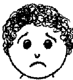
02=Disagree XNŪ ē HĀ#∞